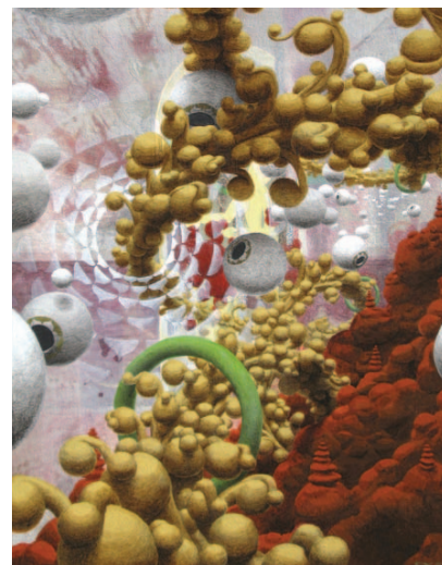
Threshold Crossing , 2006, acrylic on wood, 18 x 23"