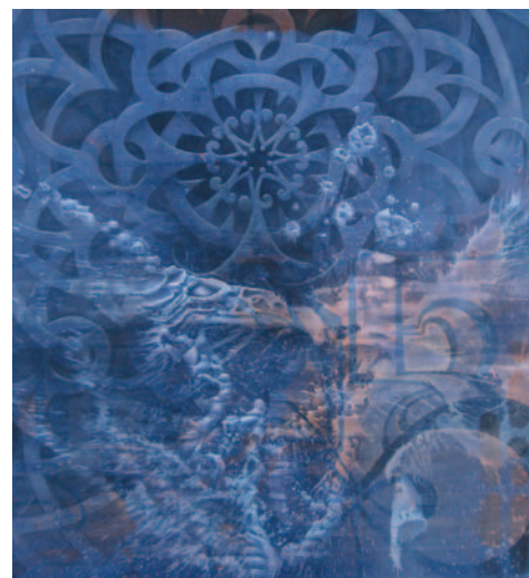
Bliss in Dissolution , 2006, acrylic on canvas, 64 x 72"